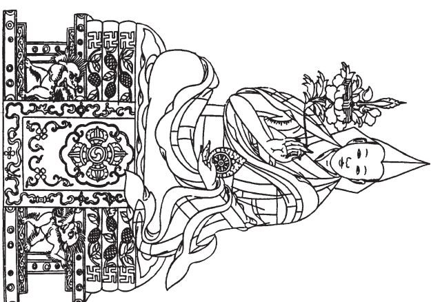
Line drawing of His Holiness the 14th Dalai Lama. Artist unknown.

May there be immediate success for all the social service projects: hospices for the dying, clinics for sick people, and Universal Education; may all the projects of the FPMT in general, and the centers be successful – most beneficial – for sentient beings. May we be able to fulfill all of His Holiness the Dalai Lama's wishes, now and in all future lifetimes.