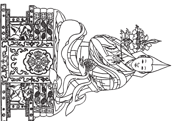
Line drawing of His Holiness the 14th Dalai Lama. Artist unknown.

May there be immediate success for all the social service projects: hospices for the dying, clinics for sick people, and Universal Education; may all the projects of the FPMT in general, and the centers be successful – most beneficial – for sentient beings. May we be able to fulfill all of His Holiness the Dalai Lama's wishes, now and in all future lifetimes.