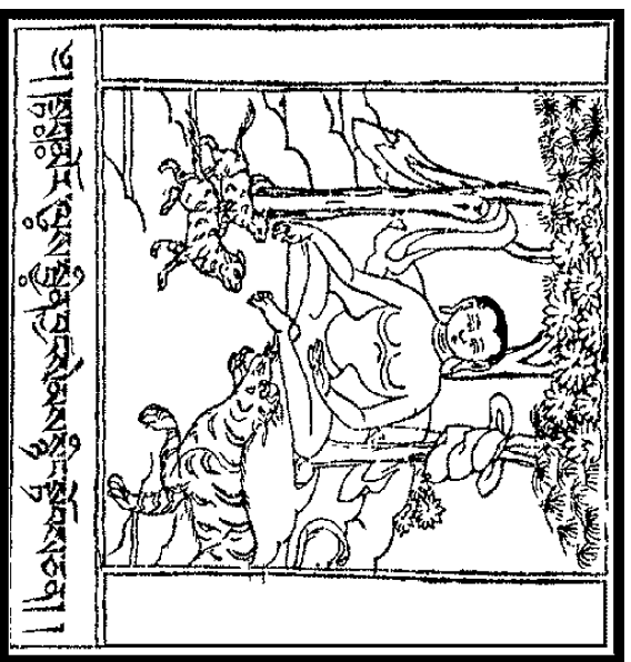
Buddha Offering His Body to the Tigers Woodblock print