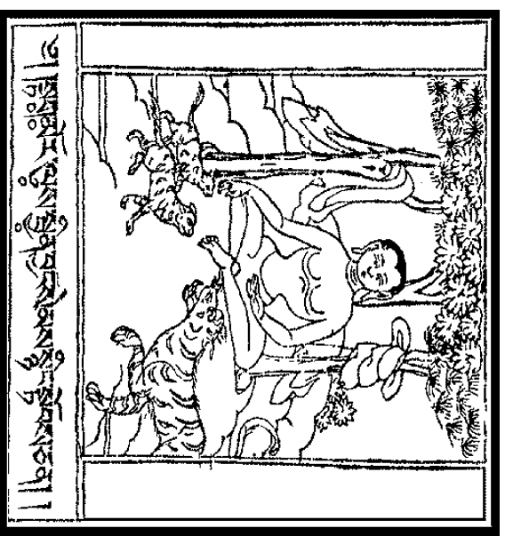
Buddha Offering His Body to the Tigers Woodblock print

advice from Lama Zopa Rinpoche and others